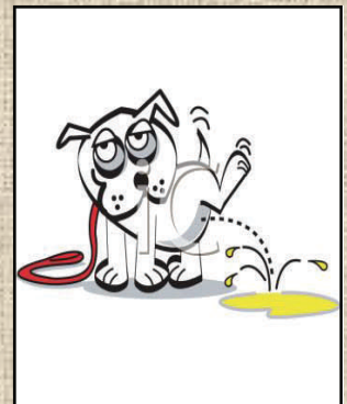
A canine's way of marking friends and influencing people.