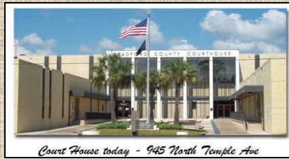
Court House today - 945 North Temple Ave

According to the 2010 census, Bradford County has a population of 28, 520, increasing its population by 9.3% since the 2000 census, a land area of 293.13 square miles, water area of 6.91 miles, an average January temperature of 55.9 degrees and an August average of 81.4 degrees. Bradford has, according to the 2010 census, 97.3 people per square mile. Bradford is a beautiful county with a rich history.